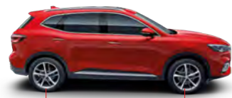
Wheelbase 2720mm Length 4574mm