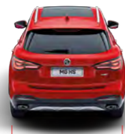
Height - including roof rails 1664mm Rear track 1584mm Width - excluding mirrors 1876mm