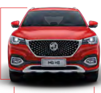
Height - including roof rails 1664mm Front track 1573mm Width - including mirrors 2078mm